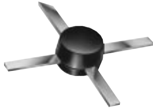
CASE STYLE: VV105